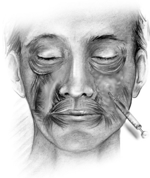
Fig 3 Schematic drawing of a facial lipoatrophy (right side) and the injection of a filler substance (left side); it illustrates on the left side of the face the area to be filled with Bio-Alcamid for correction of severe facial lipoatrophy. Note that the filling material is beneath the orbicularis muscle.

allows it to be suitable filler for the correction of slight and also very serious aesthetic defects of facial lipoatrophy.